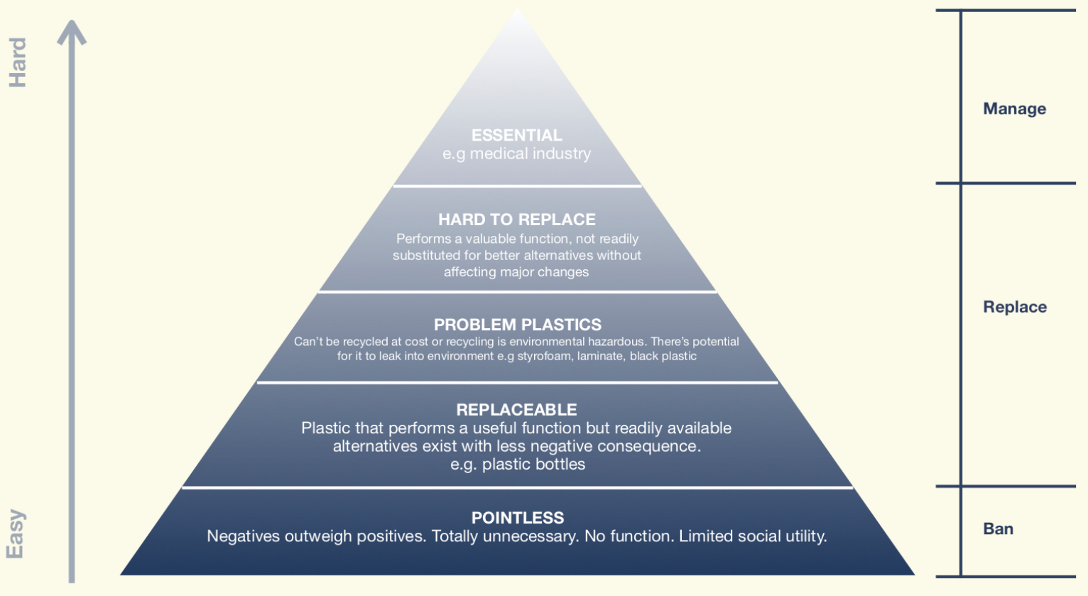
Figure 1: A hierarchy of plastics, based on the complexity of addressing them and the most appropriate strategy.

Two breakout groups identified the value of using a hierarchy or scale to describe how different plastic product types could be managed – rather than an approach based on independent definitions for 'avoidable' and/or 'unnecessary'. One direct output is summarised in Figure 1 below: